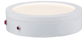
SM567784WTWT Lencir LED 7" RD w/ 1.5 hours Emergency Back Up