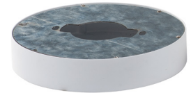
SM567780WT Empty Shell for 7" Round Lencir