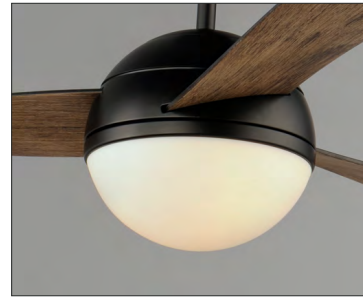
Lamp light kit with domical glass