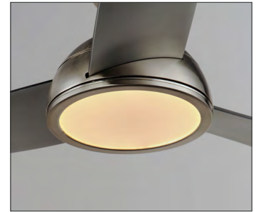
LED integrated dome