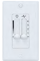
AC Control (FCT8881WT)