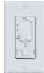
AC Control (FCT88801WT)